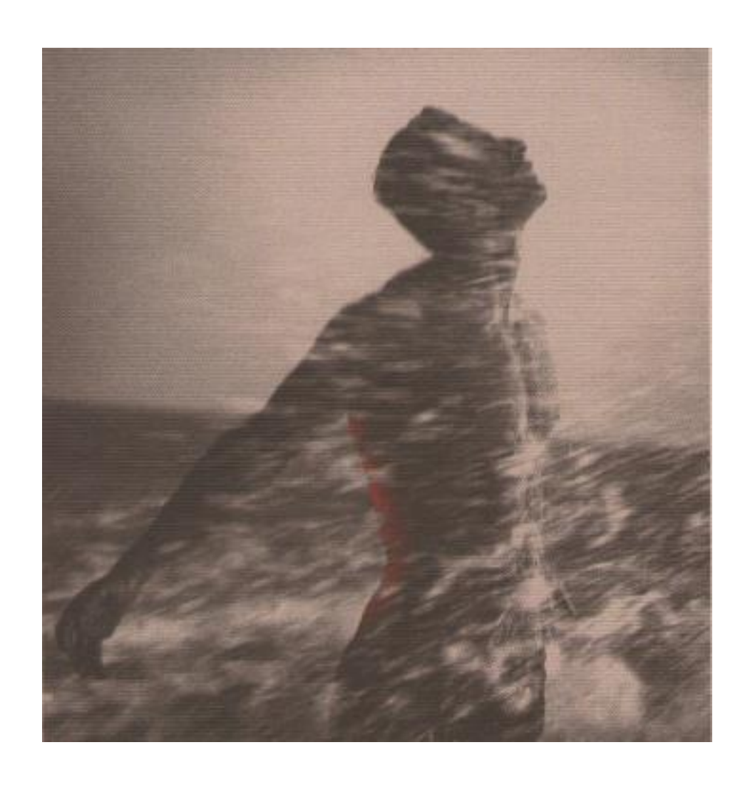
Understanding of situation & experience provides strength to face odds & survive!