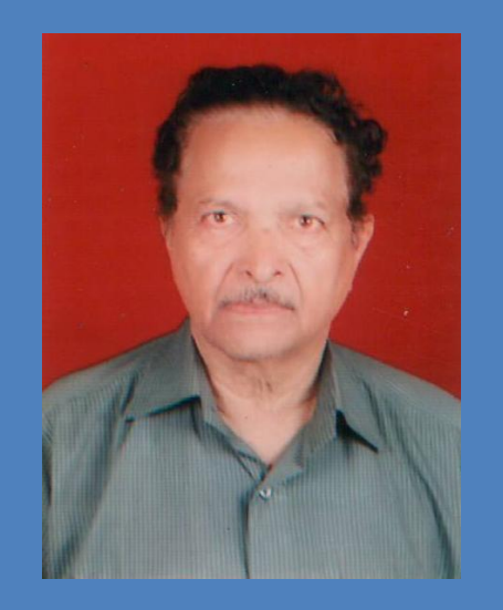
The firm through its journey over last 59 years emerged as a distinguished & prominent firm of professional's in the surrounding area.